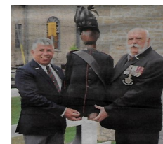
Repatriation of Voltigeur Uniform, Blockhouse Opening 2018.