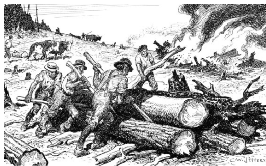
Cutting logs