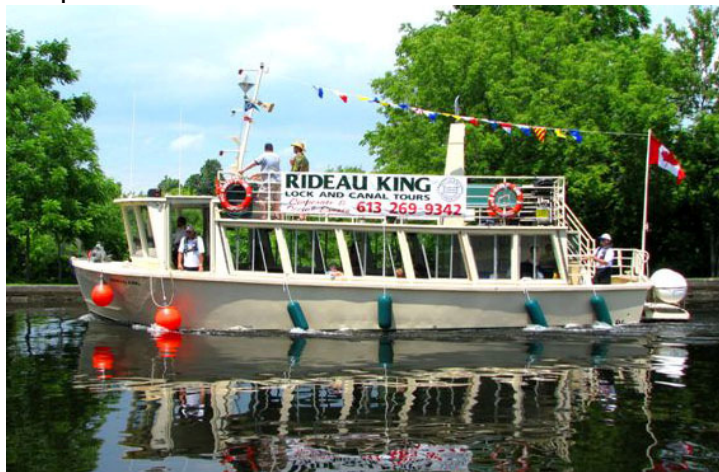
the Rideau King (Technically, Rideau King 2 nd )