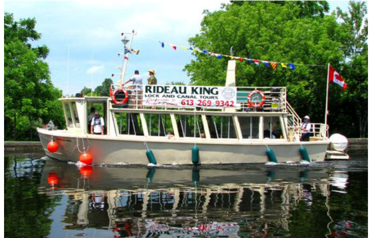
the Rideau King (Technically, Rideau King 2 nd )